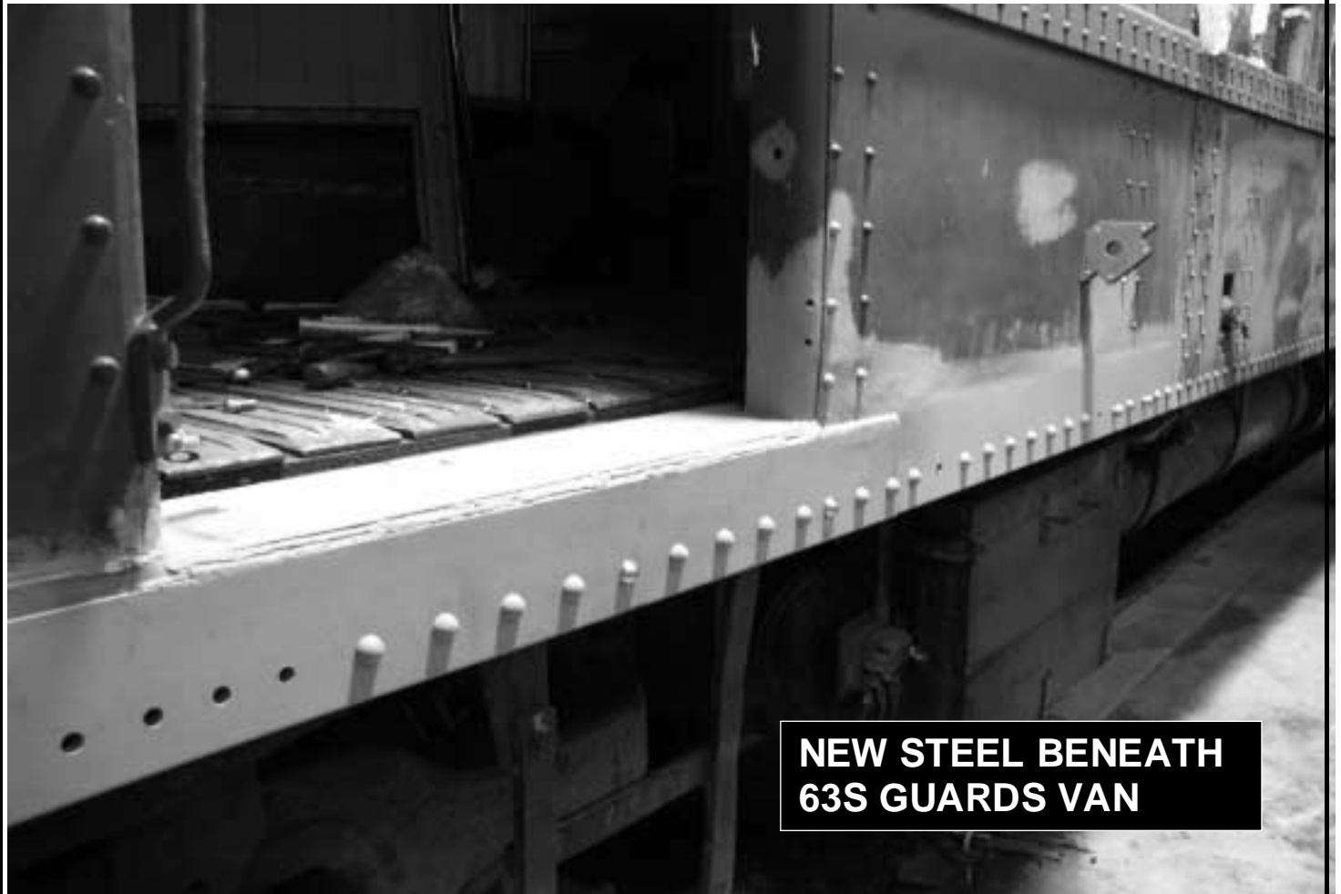
NEW STEEL BENEATH 63S GUARDS VAN