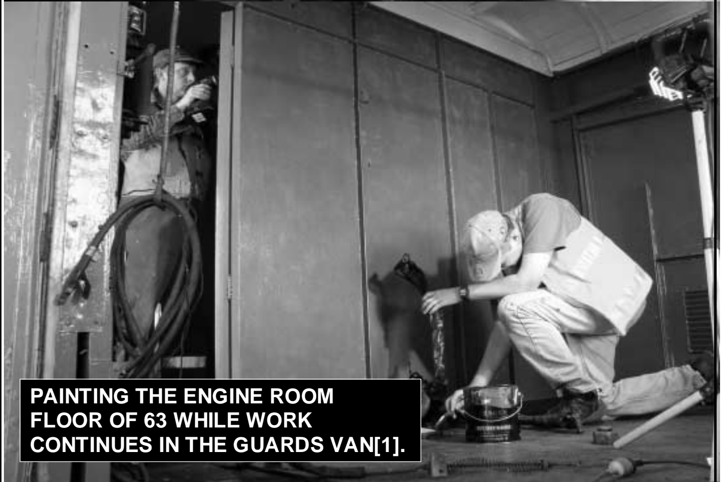
PAINTING THE ENGINE ROOM FLOOR OF 63 WHILE WORK CONTINUES IN THE GUARDS VAN[1].