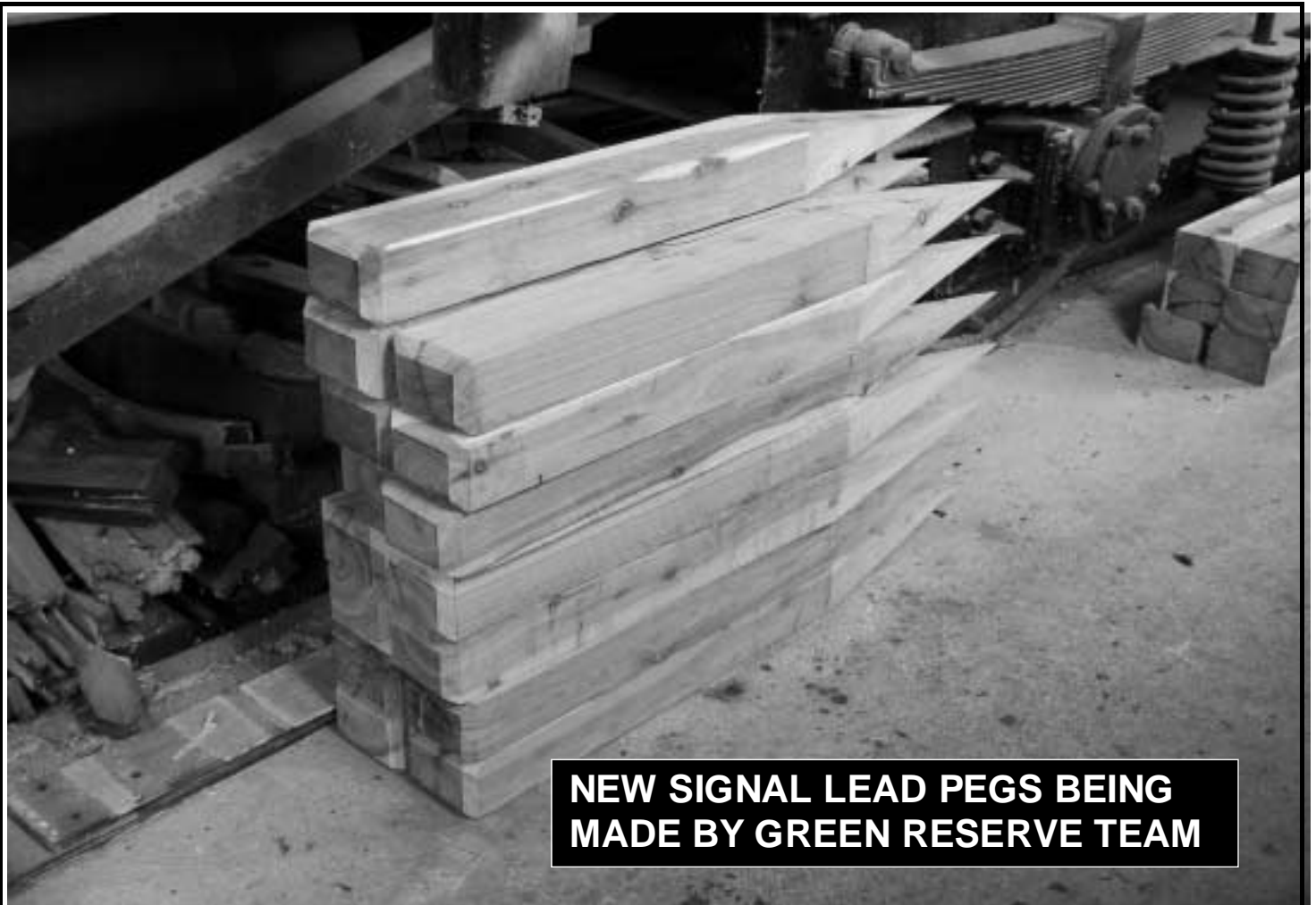
NEW SIGNAL LEAD PEGS BEING MADE BY GREEN RESERVE TEAM