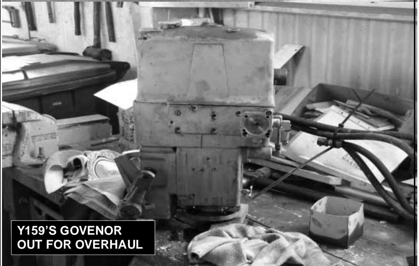
Y159'S GOVERNOR OUT FOR OVERHAUL