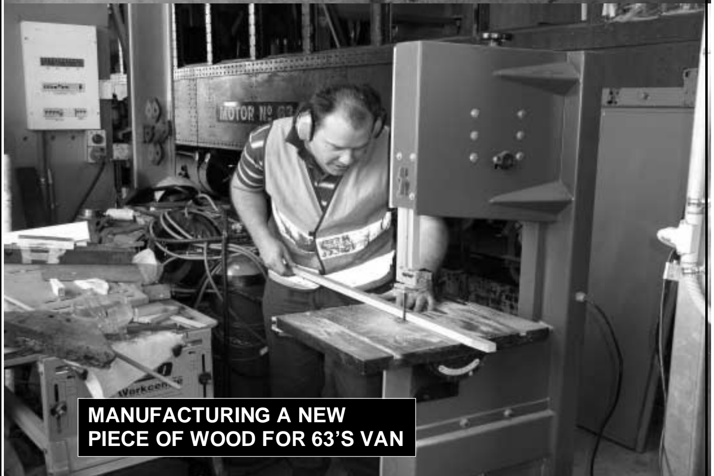
MANUFACTURING A NEW PIECE OF WOOD FOR 63'S VAN